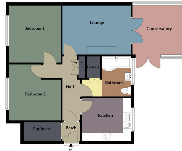
Total area: approx. 72.8 sq. metres (784.0 sq. feet)

Astleys use all reasonable endeavours to supply accurate property information in line with the consumer protection from unfair trading regulations 2008. These property details do not constitute any part of the offer or contract and all measurements are approximate. The matters in these particulars should be independently verified by prospective purchasers and it should not be assumed this property has all the necessary building regulations and planning permissions. Any heating, services and appliances have not been checked or tested. Floor plan is not to scale and is for illustrative purposes only. Plan produced using PlanUp.